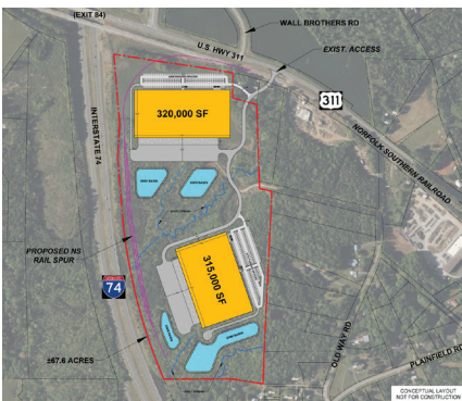
311 S. Site

Pictured below are two sites that are actively being prepared for development.