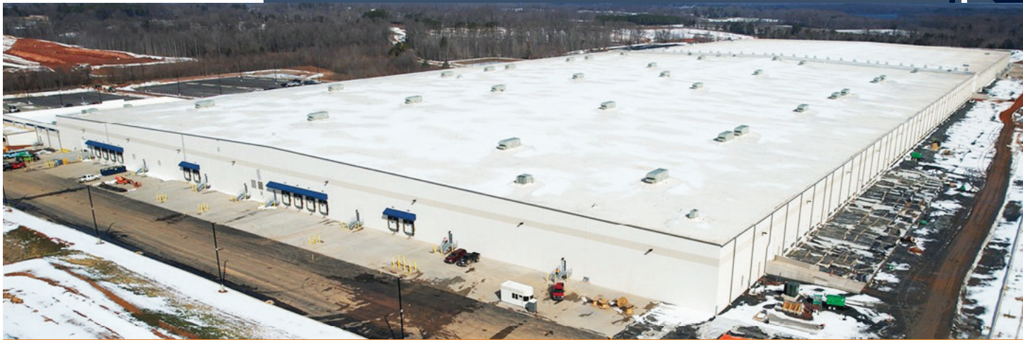
Ross Stores Distribution Center