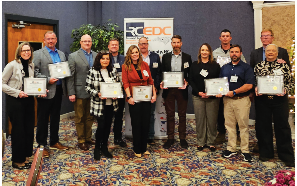
Milestone Appreciation Luncheon