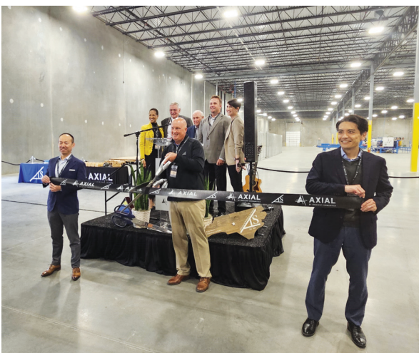
Structural Building Solutions - Archdale