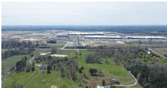
Toyota Battery Manufacturing North Carolina

Our last two fiscal years have seen record-breaking announcements for jobs and investment, so we were expecting things to be a bit quieter headed into this year. Then, in October, Toyota announced another 3,000 jobs and an additional $8 billion investment bringing their total commitment to 5,100 jobs and $13.9 billion in investment. Voila, we found ourselves in another record-breaking year.