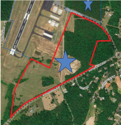
Asheboro Airport Site

We continue to prepare sites for potential new industrial users, an effort which has resulted in projects wins. For example, four years of planning and preparation went into the I-74 Industrial Center which Ross Stores recently selected for their newest distribution center. Without that preparation, Ross would have gone somewhere else.