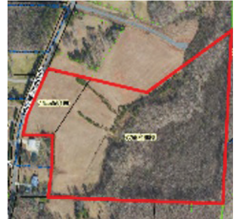
West Randleman Business Park