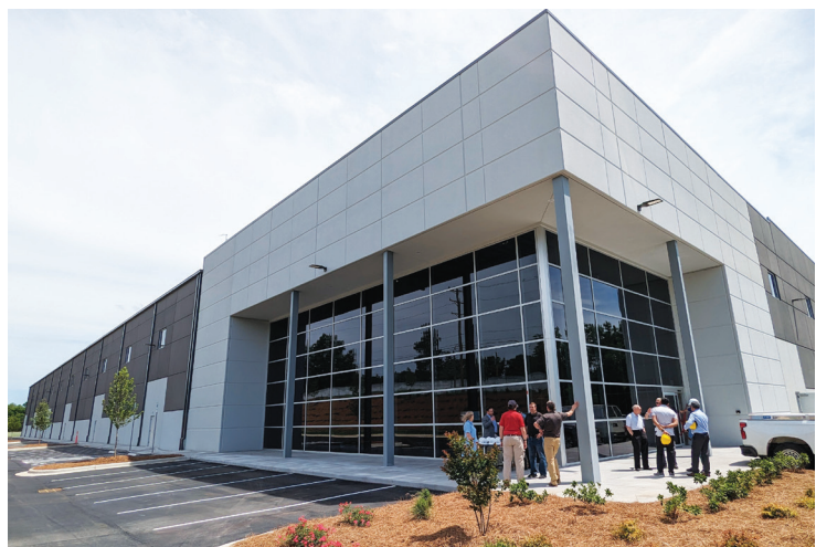
Axium Packaging - Archdale