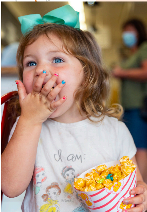
Treats at the Asheboro Popcorn Co.

Small town lifestyle plus metropolitan areas closeby