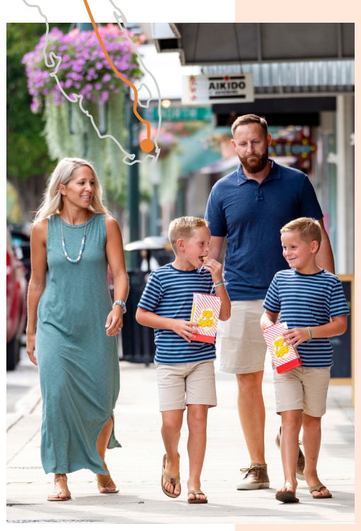
Family fun in downtown Asheboro

Randolph County employers in this sector include global companies such as The Timken Company and Kennametal and local operations such as Unique Tool and Manufacturing