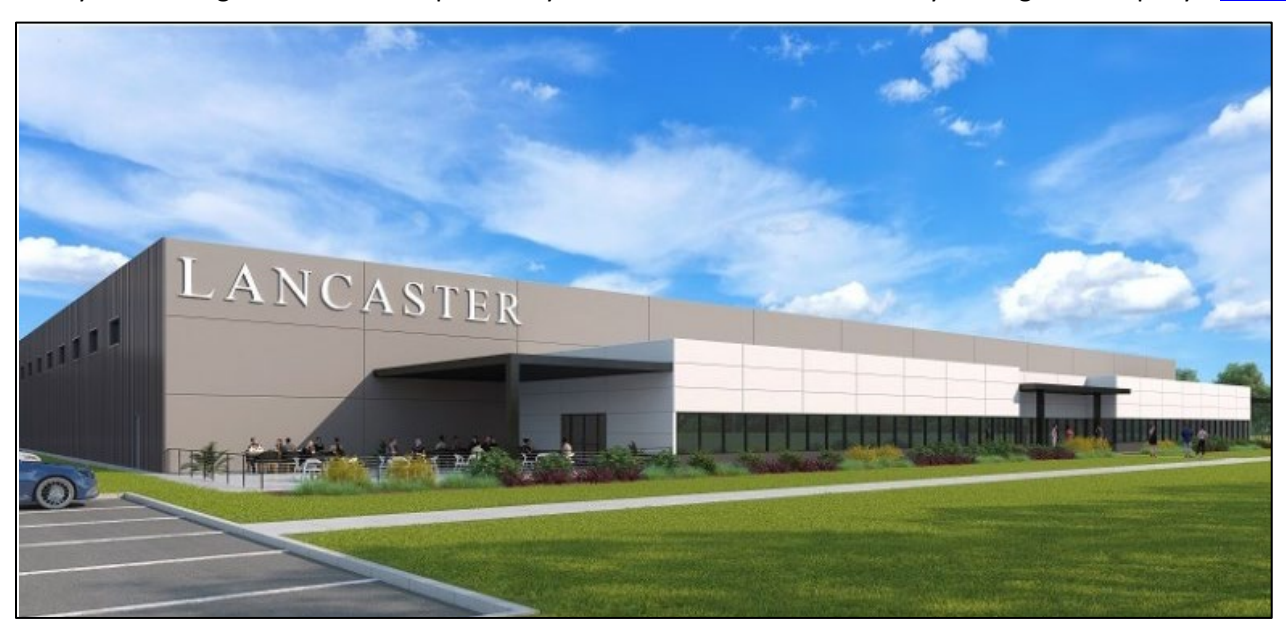
Architectural rendering of new facility provided by Lancaster, Inc.

Lancaster, Inc. recently <u>announced</u> that it will expand its operations in Archdale. As Lancaster continues to see impressive growth in sales of its high-end upholstered furniture, the company has outgrown its 18,000 square-foot facility and will build a new $5 million, 60,000 square-foot facility on a nearby site. Working closely with the City of Archdale, Randolph County, and Randolph EDC, Lancaster was offered incentives of up to $120,700 over five years to encourage them to remain in Randolph County. Owner Bill Lancaster stated, "The support from the City of Archdale and Randolph County was a predominant factor in our decision to remain in this area." With this announcement, Lancaster will retain all 25 of its full-time employees and will create at least 27 new jobs over 5 years, with an average salary of $46,000. We are excited to see our local industries growing, and demonstrating the ability to do so right here in Randolph County. Learn more about Lancaster by visiting the company's <u>website</u>.