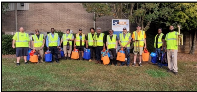
Pictured above: Last year's Forklift Rodeo Participants